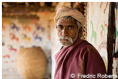
Rathwa Man At Home #1