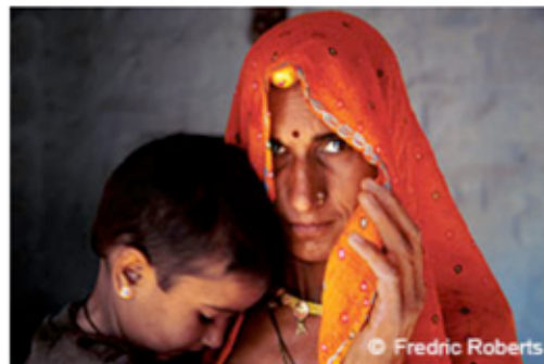
Vishnoi Mother And Child